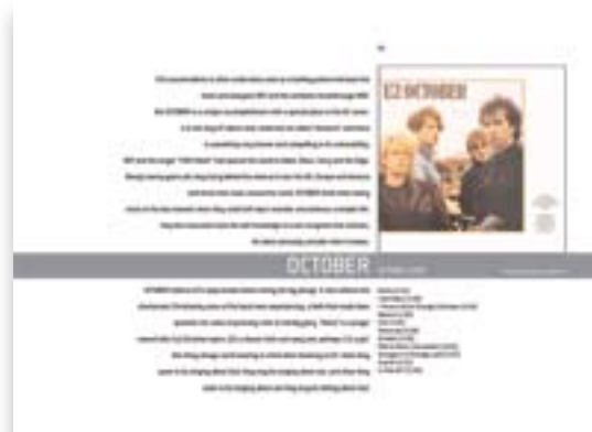
U2, The Complete U2