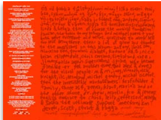
Bjork, One Little Indian