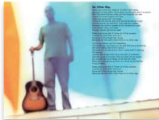
Jack Johnson, In Between Dreams