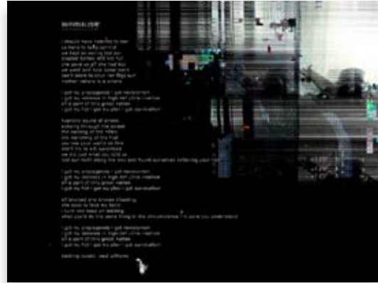
NIN, Year Zero